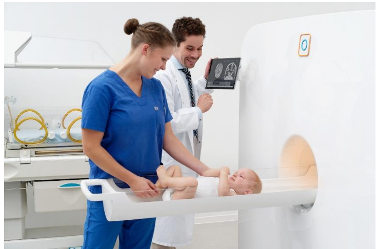
Shrunk to a quarter of usual size & weight: The new MRI scanner by Neoscan for new-borns, infants and children up to two years.