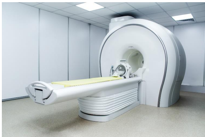
A typical MRI scanner with 8 tons of weight

The technology and field strength of the Neoscan machine is identical to current scanners so that no new clinical studies are required to validate it.